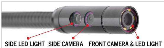
SIDE LED LIGHT SIDE CAMERA FRONT CAMERA & LED LIGHT