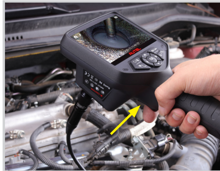
1-BUTTON PHOTO/VIDEO SHOOT BUTTON: EASY-TO-USE WITH ONE HAND