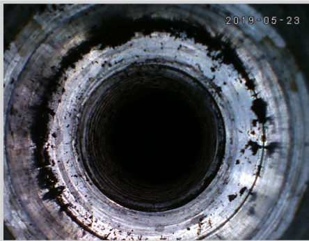
8.5MM CAMERA HEAD FITS MOST SPARK PLUG HOLES