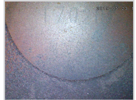
BRIGHT LED FLASHLIGHT MV480 ONLY